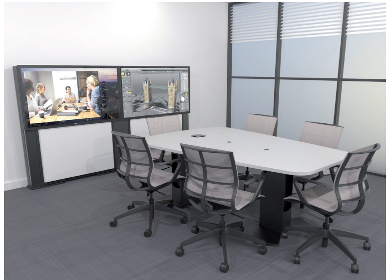
Shaped table with Dual 55" display. Showing integrated table box and cable grommet

Removing the frustration often found with tables covered in cables and other technology.