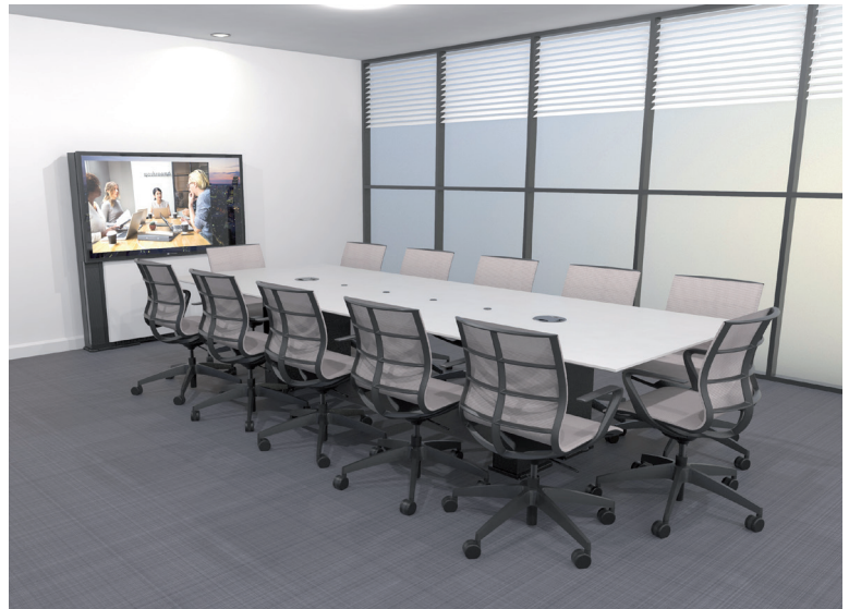
Shaped table with Single 75" display. Showing integrated table box and cable grommet

Removing the frustration often found with tables covered in cables and other technology.